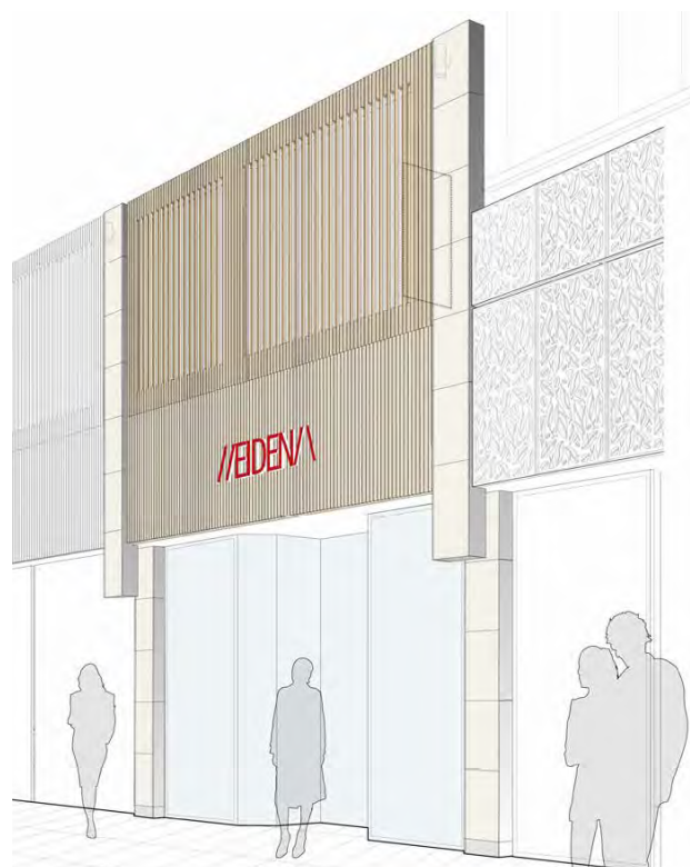
Type 1 – Timber