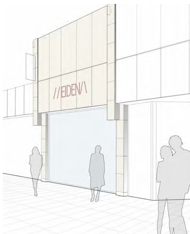
Type 4 – Plasterboard treatment