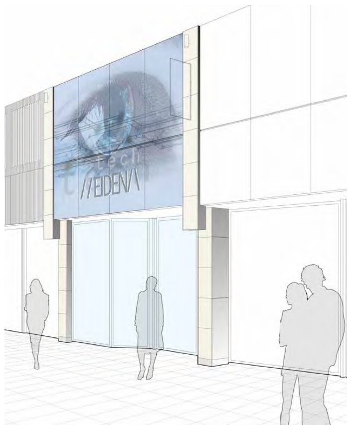
Type 3 – Graphic treatment